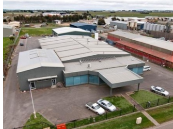
INDUSTRY Rain water harvesting Wash down