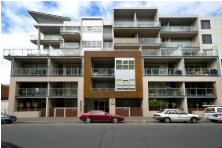
BOOSTER SYSTEMS small domestic or commercial sites