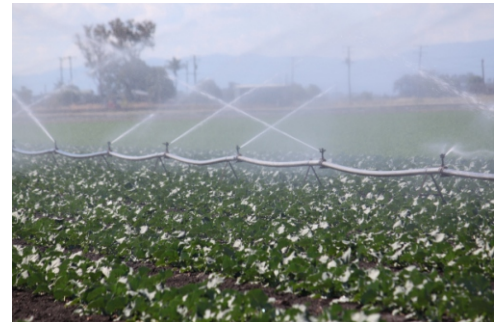
IRRIGATION Sprinkler, drip or spray.